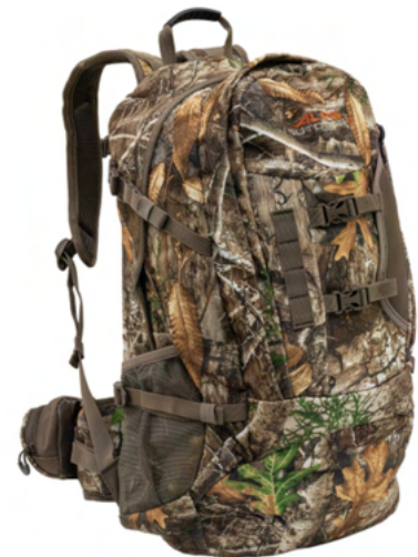
ALPS OutdoorZ Falcon Pack Product No. 9412109

Review all products online at www.alpsbrands.com