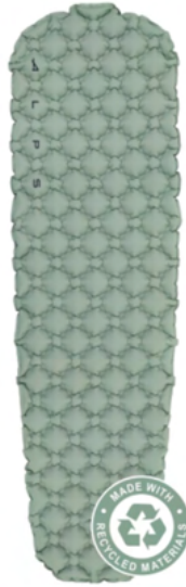
ALPS Mountaineering Flicker Sleeping Pad Product No. 7151330