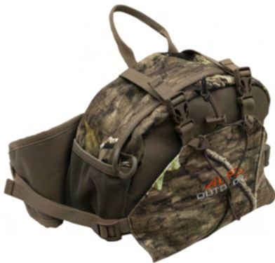
ALPS OutdoorZ Prospector Pack Product No. 9410215