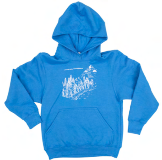
ALPS Mountaineering Youth Woods Hoodie Product No. HMY0200