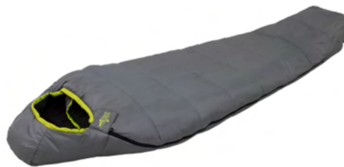
ALPS Cedar Ridge Alloy 0 Product No. 4911548