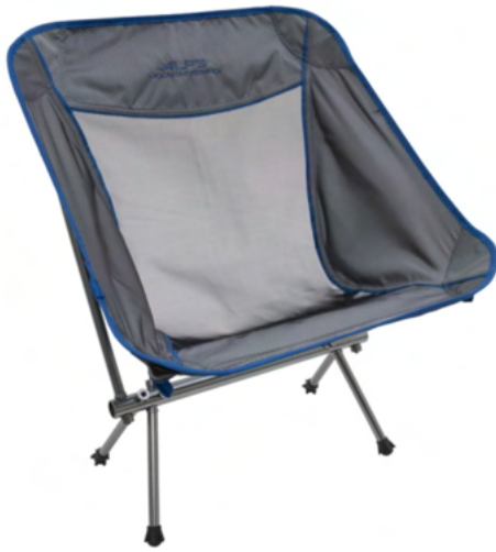
ALPS Mountaineering Dash Chair Product No. 8010041