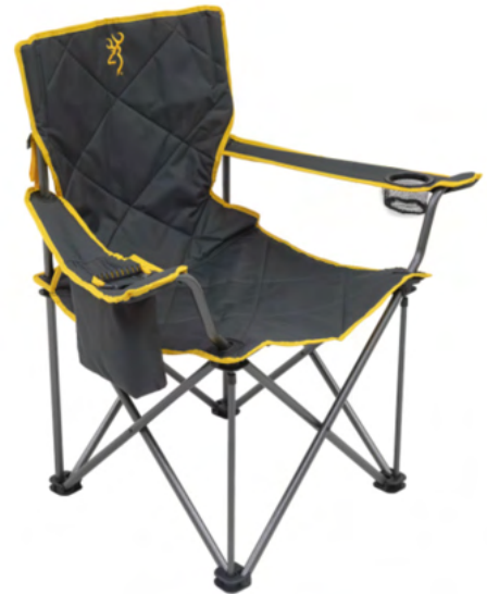
Browning Camping King Kong with Cooler Product No. 8149918