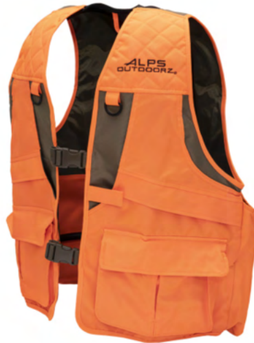
ALPS OutdoorZ Upland Game Vest Product No. 7730930