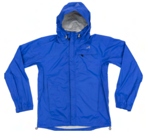
ALPS Mountaineering Nimbus Jacket Product No. 0212002

Review all products online at www.alpsbrands.com