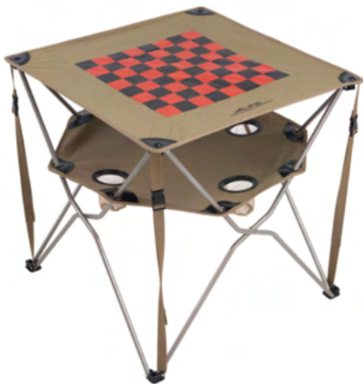
ALPS Mountaineering Eclipse Table - Checkerboard Product No. 8360114