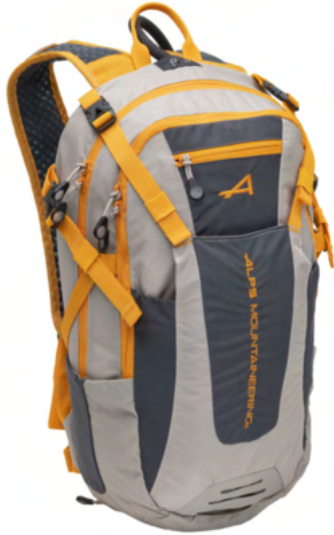
ALPS Mountaineering Hydro Trail 15 Product No. 6032047