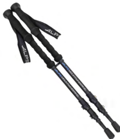
ALPS OutdoorZ Momentum Trekking Poles Product No. 7897401