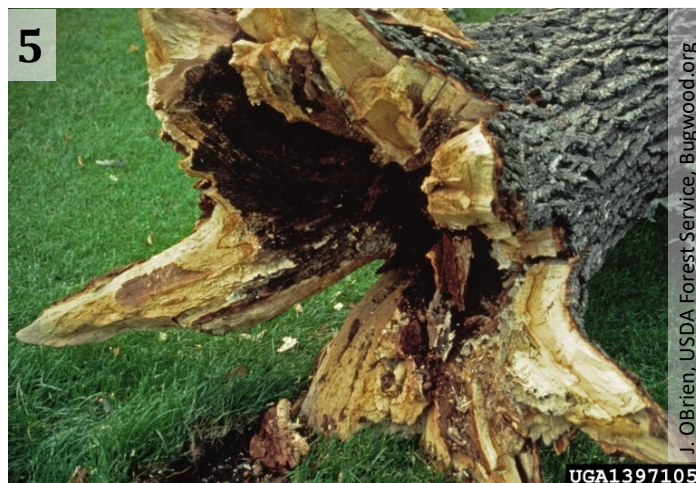
Armillaria causes root and butt rot, creating hazardous trees that are easily windthrown.