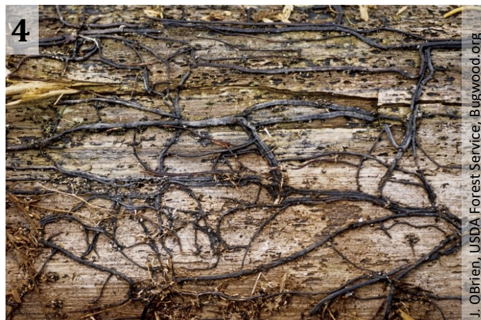
Black, string-like Armillaria rhizomorphs grow under the bark of infected trees.

Prevention: Maintaining tree vigor and reducing stress is important for reducing susceptibility to infection. In urban settings, water trees during dry periods, use mulch, and avoid wounding. In forest settings, practice good forest management and avoid damaging standing trees during construction and logging activities. If trees with Armillaria have been removed from a site, eliminating root and stump material can reduce the amount of Armillaria present to cause new infections. It may be difficult to establish new trees in areas where Armillaria is present. Good tree care and selection of Armillaria-resistant species can improve the chance of success.